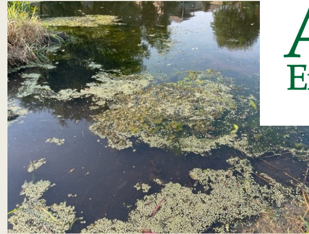
June 14, 2022